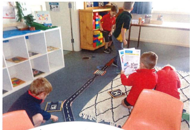
Spending time alone and time with friends