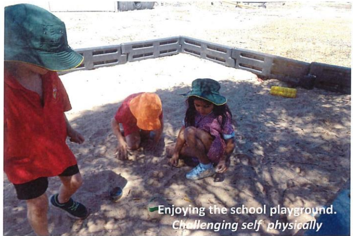
Enjoying the school playground. Challenging self physically