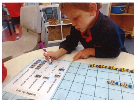
Data collection and analysis