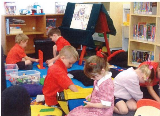
Connecting with community - Rhythm & Rhyme Time