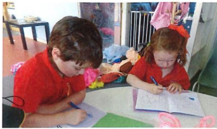
Bookmaking developing emergent writing skills