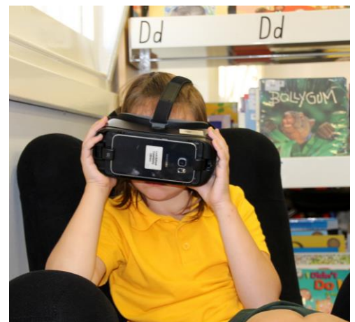
Library Lunch Time Activity Virtual Reality Glasses